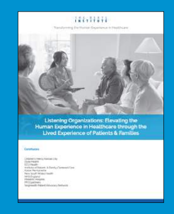
Listening Organizations: Elevating the Human Experience in Healthcare through the Lived Experience of Patient & Families