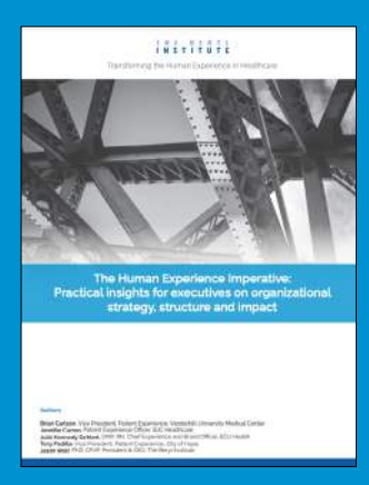
The Human Experience Imperative: Practical insights for executives on organizational strategy, structure and impact

Central to our shared commitment to transform the human experience is this series of informative and thought-provoking publications that dig into the critical issues facing the healthcare industry today. We published three PX papers in 2023.