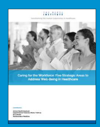
Caring for the Workforce: Five Strategic Areas to Address Well-Being in Healthcare